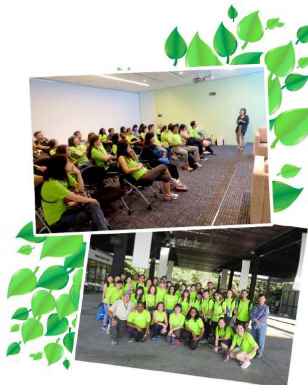
In celebration of Earth Hour 2018, StarHub employees took part in a green learning journey to better appreciate the environment.

When StarHub established its six-point green policy in 2009, the telco understood the importance of growing its business without compromising the environment.