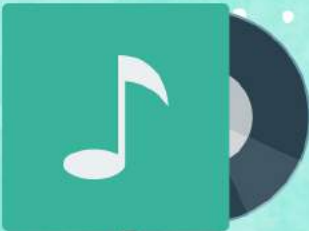
CD AND CD CASING