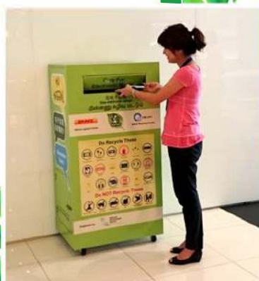
Drop off old gadgets at recycling points provided by organisations like StarHub, Dell, Panasonic and IKEA.

THAT'S ROUGHLY THE WEIGHT OF 3,800 MOBILE PHONES!