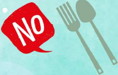
DISPOSABLE PLASTIC CUTLERY