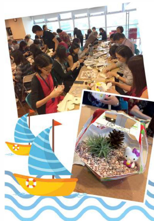
Regular eco workshops help MPA staff to cultivate a green office culture.

As a leading maritime agency, sustainability is integral to Maritime and Port Authority of Singapore (MPA)'s operations in an industry that currently accounts for two per cent of global carbon dioxide emissions.